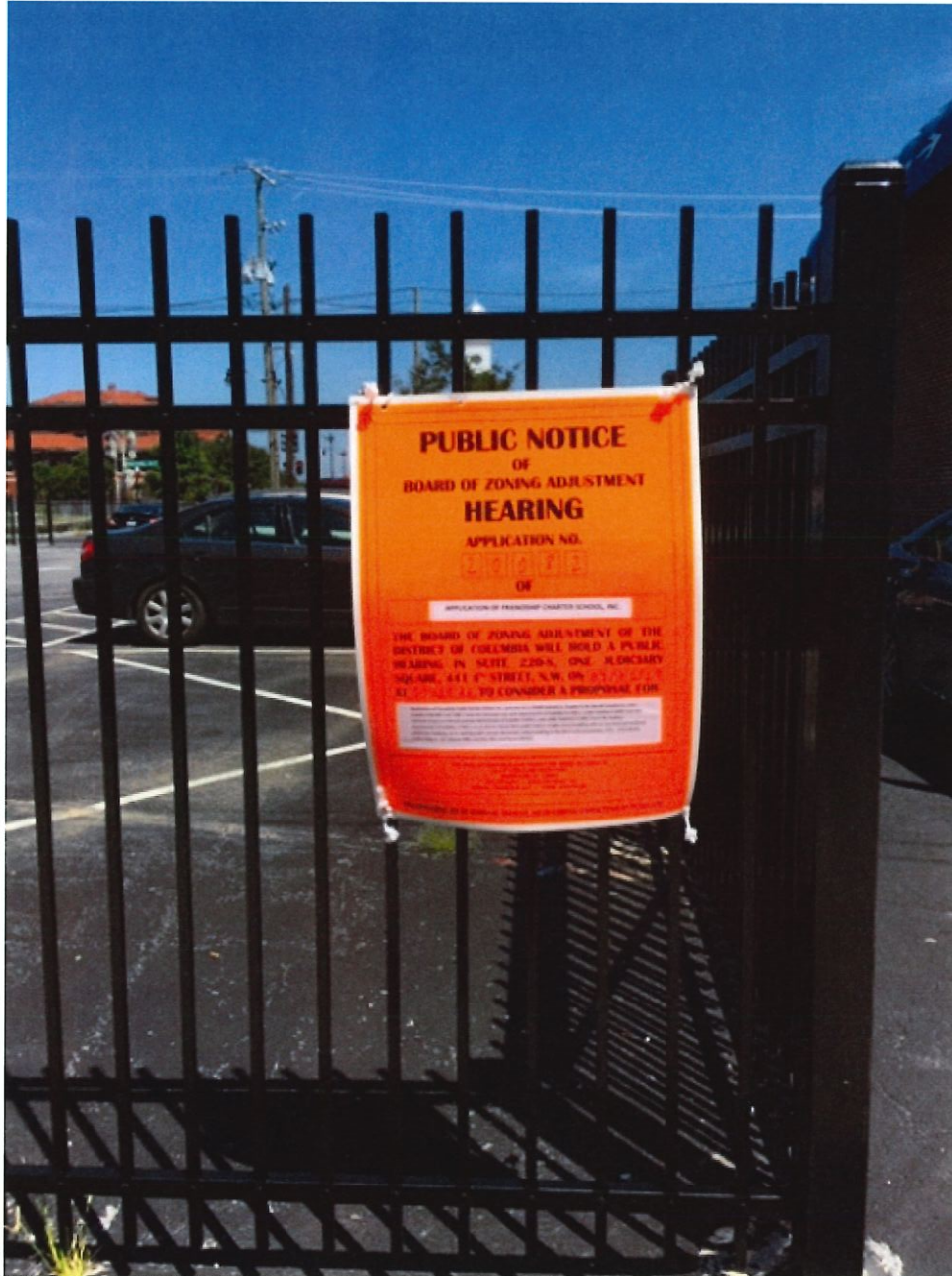
Notice 4: Tied to fence facing public alley