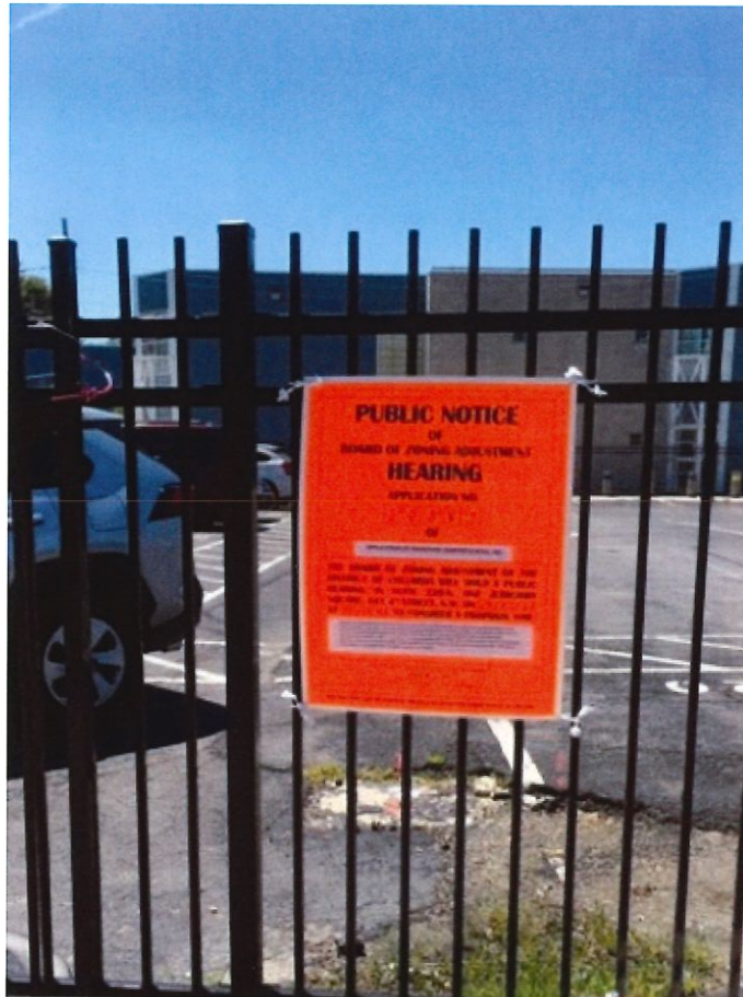
Notice 1: Tied to fence facing Martin Luther King, Jr. Boulevard, S.E. adjacent to the car wash