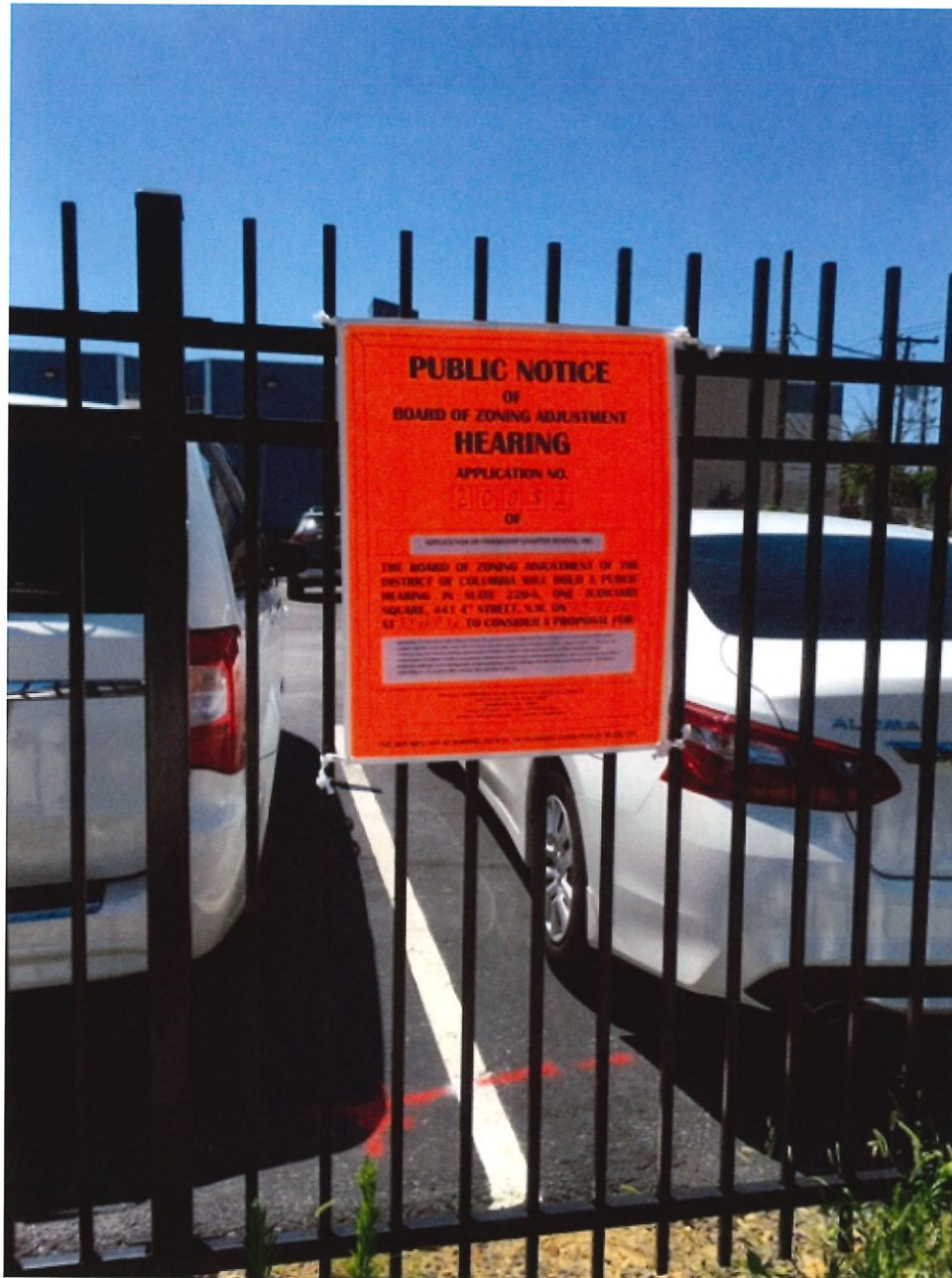
Notice 2: Tied to fence facing Martin Luther King, Jr. Boulevard, S.E.