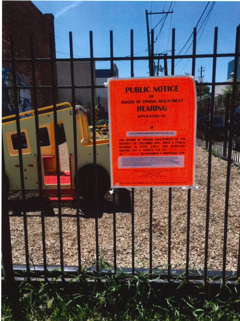
Notice 3: Tied to fence facing intersection of Martin Luther King Blvd. & Milwaukee Street, S.E.